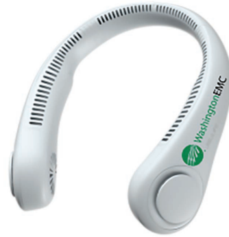
Attendance gift—neck fans

The Annual Meeting of Members of Washington Electric Membership Corp. will be held on Saturday, October 7, 2023, at Ridge Road Schools, 285 Ridge Road, Sandersville, GA, 31082, as an in-person meeting. Registration and voting will be open from 8:30 a.m. to 10 a.m. The meeting will begin at 10 a.m.